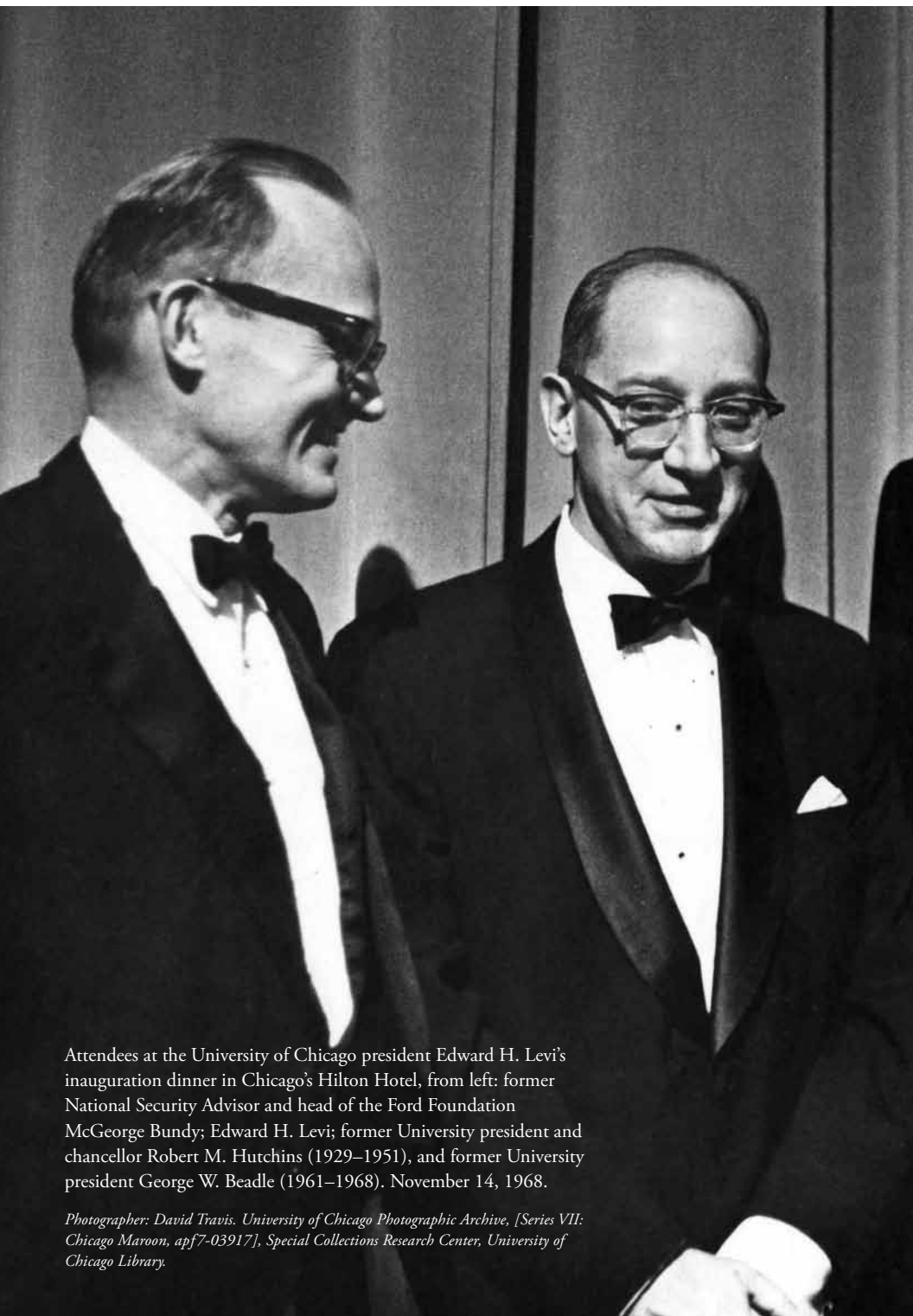
Attendees at the University of Chicago president Edward H. Levi's inauguration dinner in Chicago's Hilton Hotel, from left: former National Security Advisor and head of the Ford Foundation McGeorge Bundy; Edward H. Levi; former University president and chancellor Robert M. Hutchins (1929–1951), and former University president George W. Beadle (1961–1968). November 14, 1968.