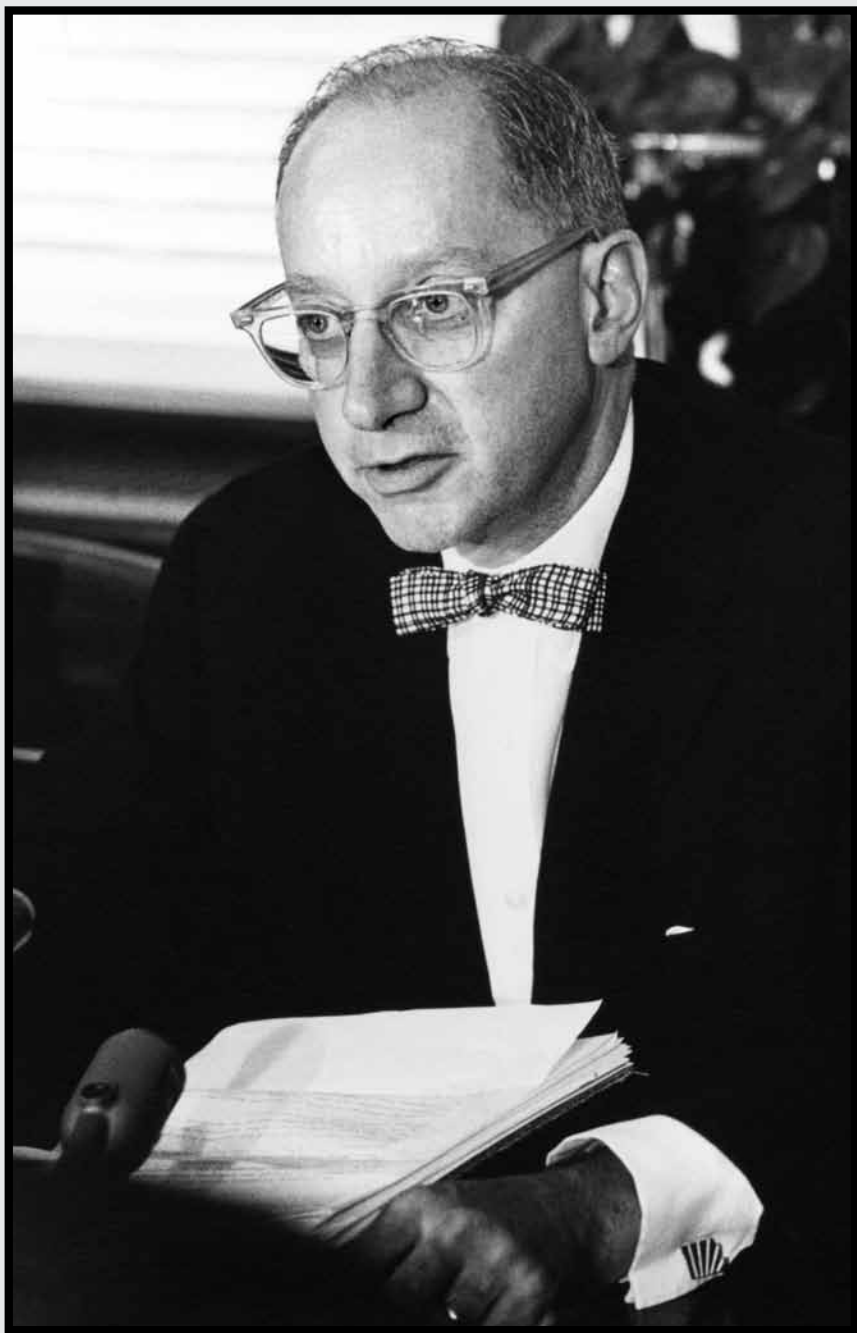
Edward H. Levi, undated