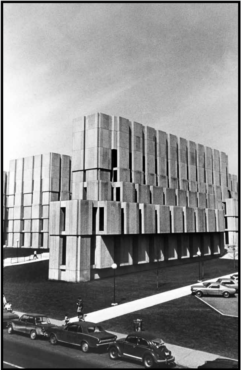
Joseph Regenstein Library, 1970