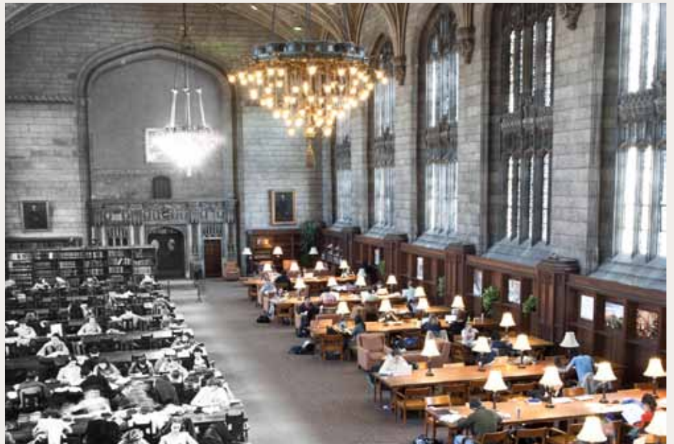
Archival photo (1945) and 2009 photo merged by Avi Schwab, AB'03.

What hasn't changed since 1945? The workload.